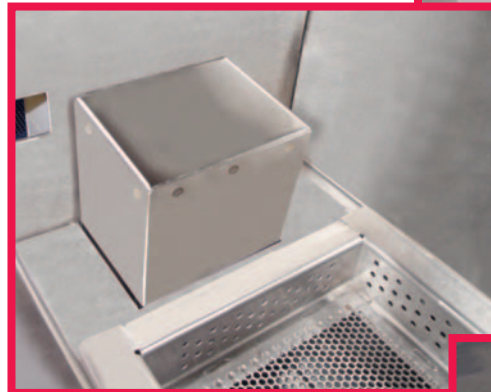
NEW MODEL INSTALLED

CMA continues to advance our reputation for innovation, based on feedback from our customers. This new design allows for effortless removal, to encourage proper and frequent cleaning of debris that can accumulate on and around the Float Switch. The old design was difficult to access, limiting the ability to remove for cleaning.