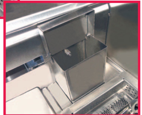
OLD MODEL (NON-REMOVABLE)