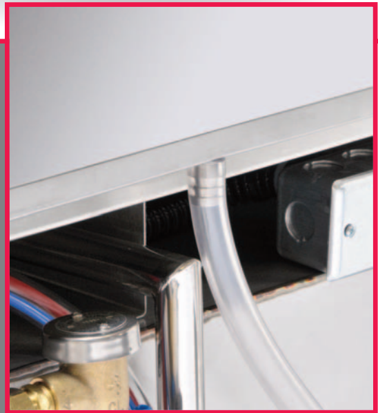
Back view of drain board showing drain hose

Drain Board P/N: 3706.00 Size: 24"W X 26"D