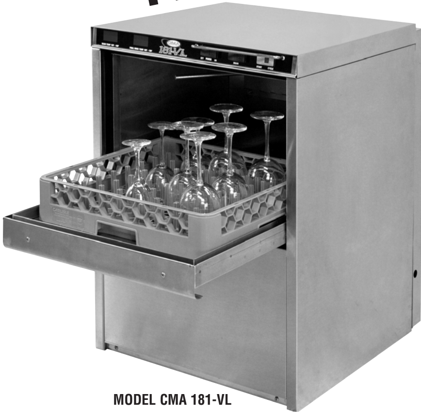
MODEL CMA 181-VL