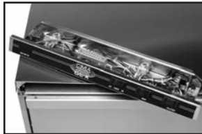
"Works-in-a-drawer". All electrical components are attached to a sliding drawer for easy access and service.