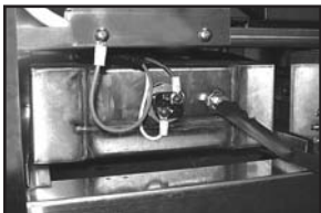
"Built in" Hot Water Assurance System provides hot water every cycle.