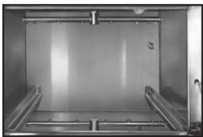
Upper and lower rotating wash arms guarantee excellent results.