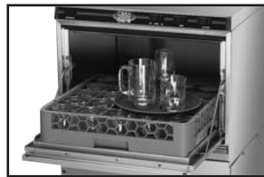
Uses standard 19-3/4" X 19-3/4" racks. Large 11-1/4" glass clearance.