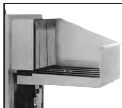
Shown with optional cornerfeed table. Available right or left.