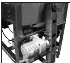
New energy efficient oil-free drive system.