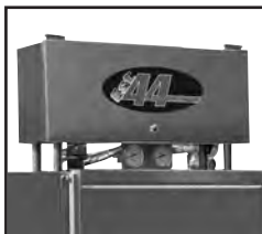
New user friendly single action control switch with easy access and easy to clean around control box.