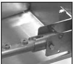
Easy to remove wash arms with captive end caps. Never lose another end cap again!