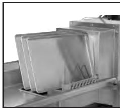
Large 19" opening accommodates larger items and utensils.