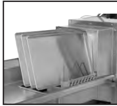
Large 19" opening accommodates larger items and utensils.