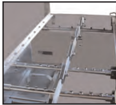
Strategically located spray arms with spray pattern positioned for additional wash coverage.