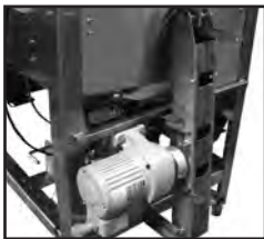
New energy efficient oil-free drive system.