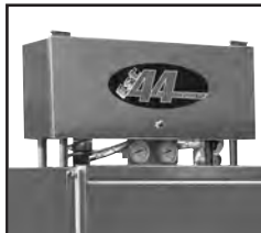
New user friendly single action control switch with easy access and easy to clean around control box.