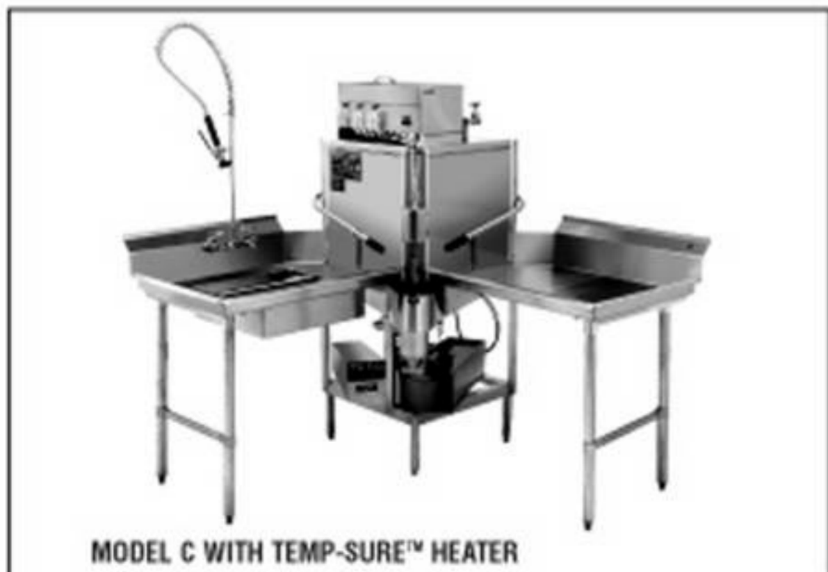
MODEL C WITH TEMP-SURE™ HEATER