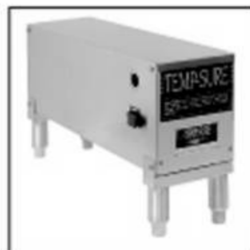
Temp-Sure™ shown as a free standing unit.