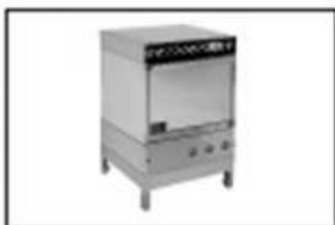
Optional pedestal allows the L-1X16 to be raised up to a full 12" off the floor for easy operator use. Height adjustable from 8" to 12".