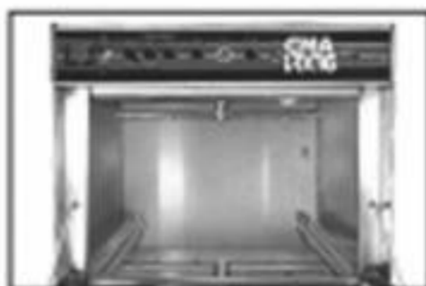
Upper and lower rotating wash arms guarantee excellent results.