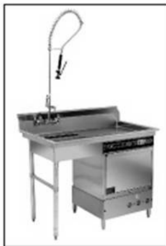
Optional dishtable, faucet and pre-rinse unit sold separately.