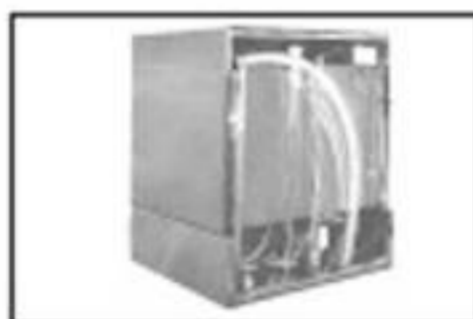
Pumped drain will drain uphill. Requires no floor drain.