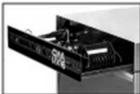
Convenient to service "Works-in-a-drawer", may be removed by unplugging one electrical connection.