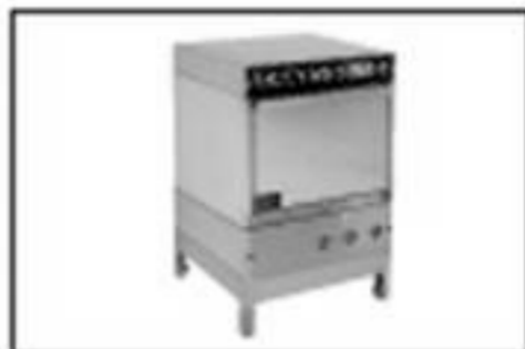
Optional pedestal allows the L-1X to be raised up to a full 12" off the floor for easy operator use. Height adjustable from 8" to 12".