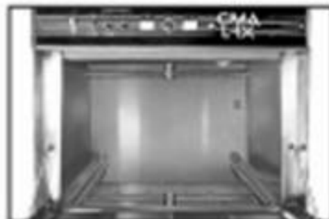
Upper and lower rotating wash arms guarantee excellent results.