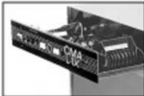
Convenient To Service. "Works-in-a-drawer", may be removed by unplugging one electrical connection.