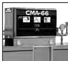
Single action control switch with easy to read temperature gauges and complete operating instructions.