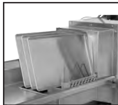
Large 19" high opening accommodates larger items and utensils.