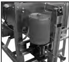
Rack saver clutch system with brass rocker arm bearing protects the machine, dishracks and table from damage.