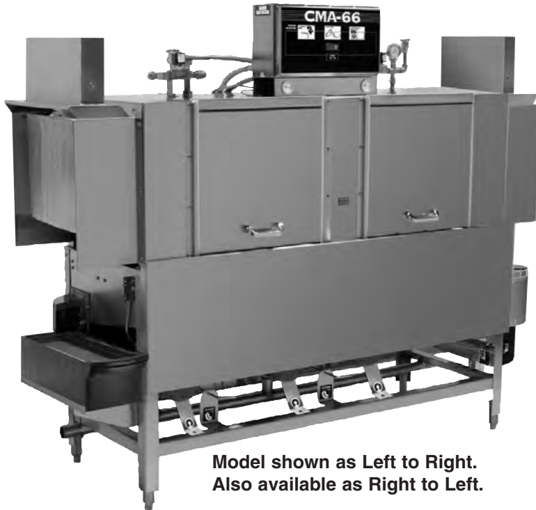
Model shown as Left to Right. Also available as Right to Left.

High Temperature 66" Conveyor Dishwasher