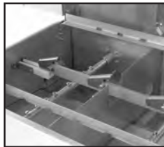
Four-stage washing process provides pre-wash, dual power wash and final rinse all in a 66" machine.