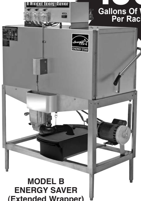
MODEL B ENERGY SAVER (Extended Wrapper)