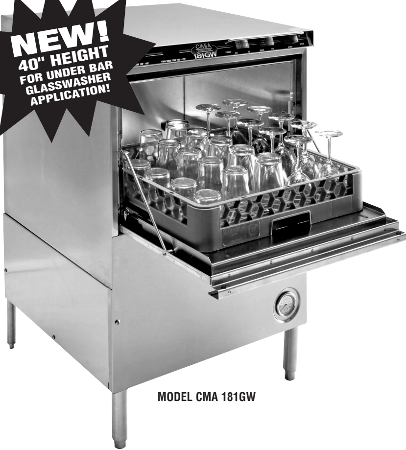
MODEL CMA 181GW

NEW! 40" HEIGHT FOR UNDER BAR GLASSWASHER APPLICATION!