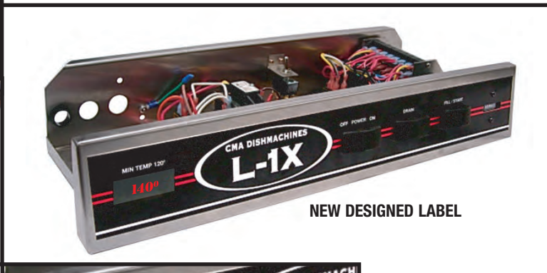
NEW DESIGNED LABEL