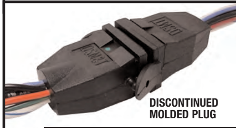
DISCONTINUED MOLDED PLUG

New machine orders to be shipped will have significant improvements and upgrades to the control panel and electronics. The following are the changes: