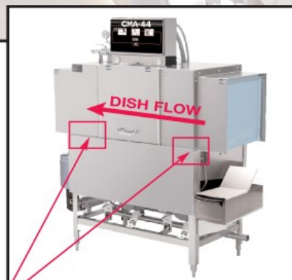
Location of new Conveyor Reed Magnet Cover