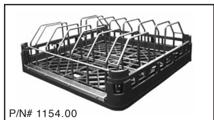
Sheet Pan Rack With Stainless Steel Insert