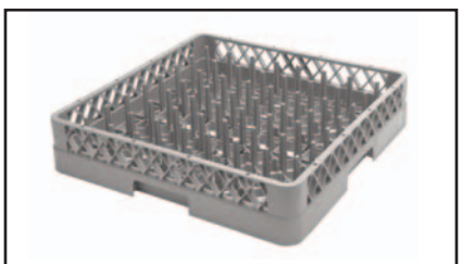
Plate & Tray (peg)